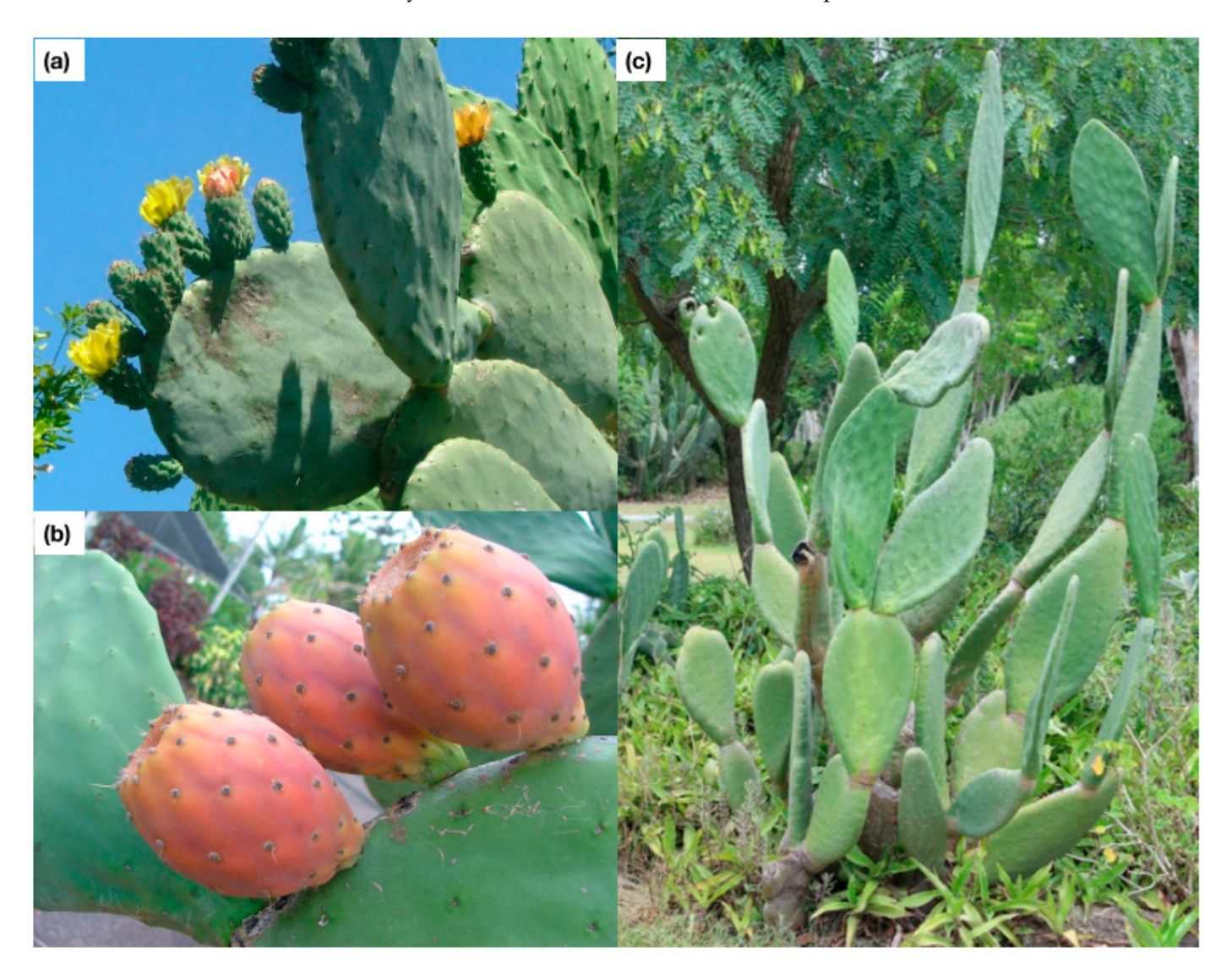
Figure 3. Photographs of the cladodes with emerging flowers ( a ), and fruit ( b ), as well as the growth form of Opuntia ficus-indica ( c ).

similar colours to the flowers, and are mostly spineless or have spines that are very fine and easy to remove. Fruit maturation occurs in late summer for O. ficus-indica , approximately 30–70 days after anthesis, and each fruit contains upwards of 200 viable seeds [74].