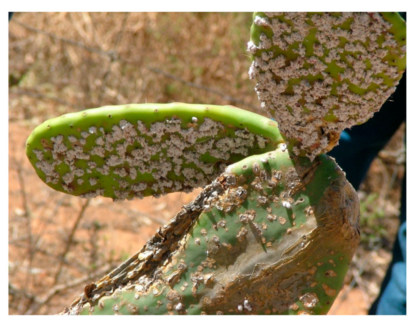
Figure 4. A photograph of the cochineal insect feeding on O. ficus-indica cladodes. The white, waxy coating produced by Dactylopius spp. is evident.

intermediate nymph life stage; they develop wings in their adult life stage and are rarely observed feeding on the cacti [95].