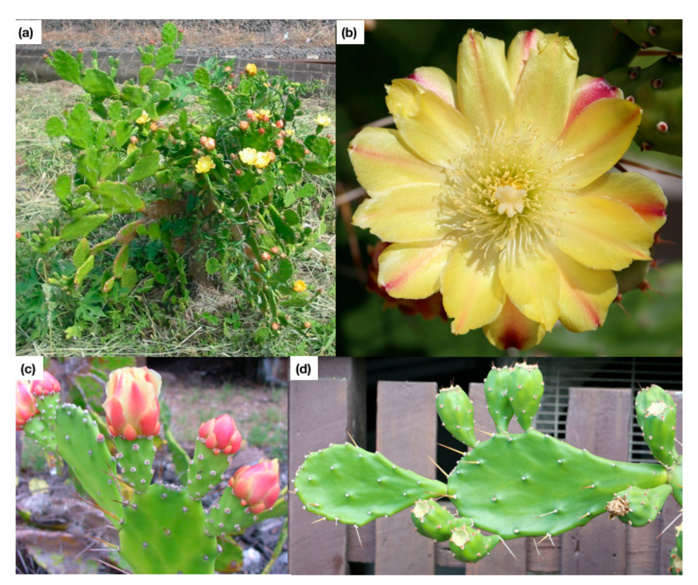
Figure 2. Photographs of Opuntia monacantha . (a) shows the growth form of a single plant; (b) shows a close up of the flowers; (c) shows a close up of a cladode with fruit and spines; and (d) highlights the narrow cladode attachment point.

strongly attached, allowing it to grow up to 3.5 m in height (Figure 2) [8,54]. Opuntia monacantha produces mostly spineless, green to red fruit from yellow flowers [8,54].